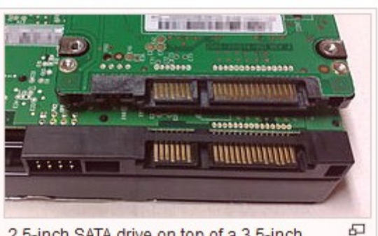
2.5-inch SATA drive on top of a 3.5-inch SATA drive, close-up of data and power connectors

This photo shows the back of a laptop hard drive sitting on top of a desktop hard drive, both with the gold pins of the SATA (Serial ATA cable connectors exposed. These use serial technology to send data to and from the computer, hence the use of only a few contacts (7 gold lines) on the left for data. In the older (PATA) technology, data was sent using parallel wires, hence the presence of at least 40 conductors in the cable shown previously. In serial, data marches in single file down one conductor. In parallel, the bits march side-by-side, requiring a lot more conductors.