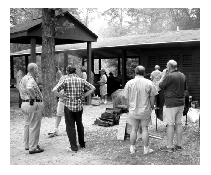
They discussed the corn water heating progress and waited in anticipation of yet another meal at the WaBeDonia park pavillian.

The 2006 cornroast was again great fun but as they say, a picture is worth a thousand words.