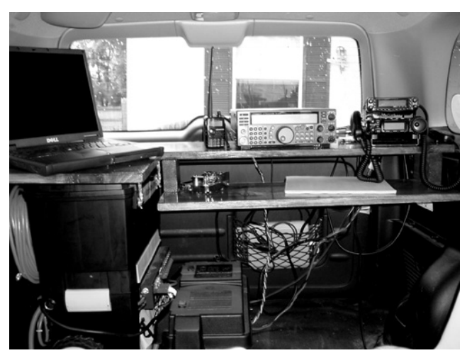
A view to the rear of Kyle Jeske's (N4NSS), Rave-4 Mobile Radio Communications Vehicle from which he operated on Field Day.

marine battery in parallel, laptop computer, Kenwood TS-570D (CW Rig), Yeasu FT-857, FT8800. The antenna was my 36 ft. pushup pole. I was hoping to have the antenna stuck in the beach but, sea turtles were nesting and I was not allowed to park close to the beach area. The no-C-ums were really bad.