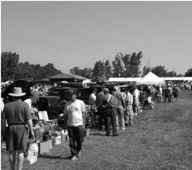
Shown is only one of the several rows of outdoor vendors selling from their vehicles at the South Milwaukee Swapfest.