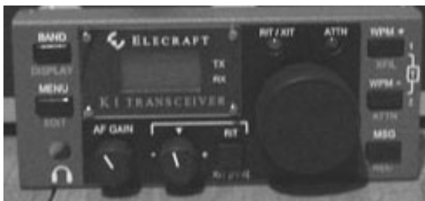
Looking at the completed K1 front panel

The Elecraft K1 with serial number 02134 is on the air. And I am very impressed.