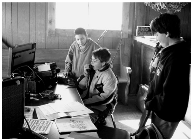
Boy Scouts at the merit badge seminar had a great time getting on the air with this portable HF station at the Jackson Town Hall.

Talk about a well-run operation. The BSA Radio Merit Badge day program was a really well organized and executed project.