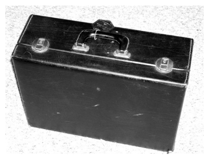
A well-worn sample case and an aversion to discard anything were the start of the HF portable station.

It all started with retirement. After being retired for awhile you start to notice certain work-related things that have not been used for years but you just could not discard. And there the project begins.