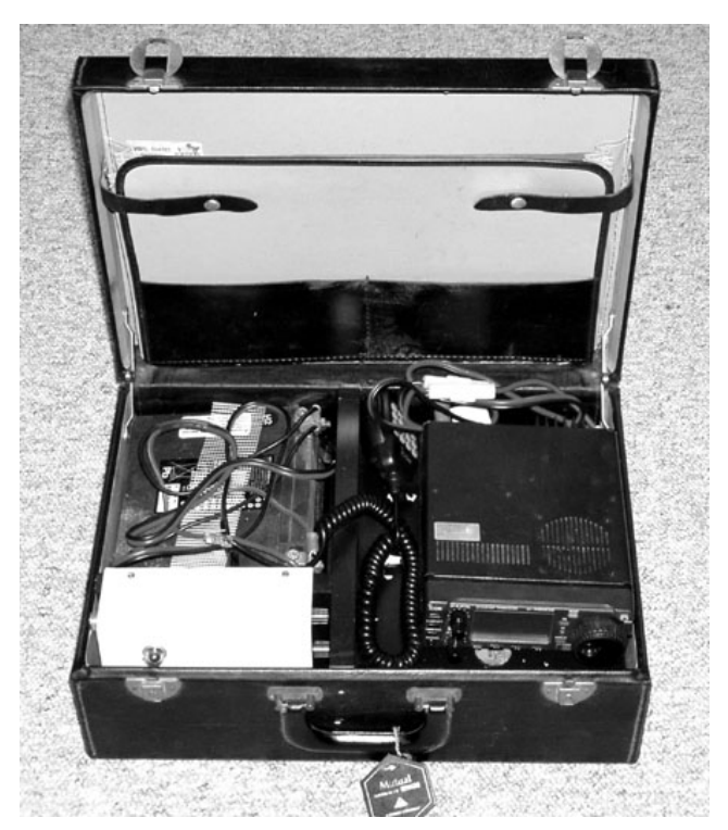
It all fits and the lid will close.