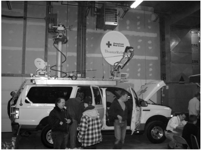
One of the 9 Red Cross Communications Vans – Wow – 14 different communications mediums – impressive.

tory and the antenna he won in the AES transmitter hunt.