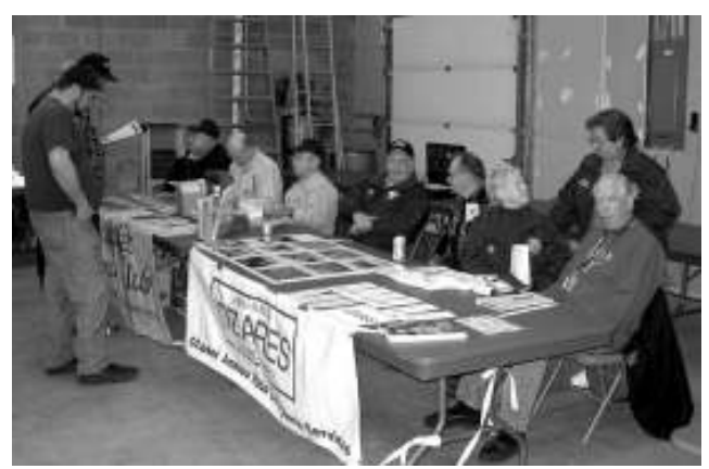
ORC members were manning both the ORC and OZARES talbes.