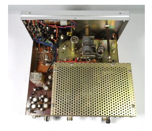
W9MXQ or KE9PQ Photo

As noted above, the IC-700T transmitter has no included VFO, so it had to be connected to the IC-700R for transceive operation – its only option. There were two interconnections between the units. First was a coaxial cable between VFO in the receiver to the transmitter that is handled with a low loss coax connection between phone jacks on both units. Also, as mentioned above is a Control Cable that connects to a seven pin miniature socket on each chassis. This connector is a seven pin tube socket connector. The plugs are identical to the External VFO connectors used by Kenwood on their hybrid transceivers. The IC-700T Transmitter used a pair of then common 6146B tubes in the final amplifier, a 12BY7A driver tube, and a 12AU6 tube as a buffer tube feeding VFO signal from the VFO in the receiver to the transmitter circuitry.