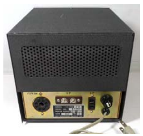
IC-700PS Power Supply IC-700 Station Rear Panel Views