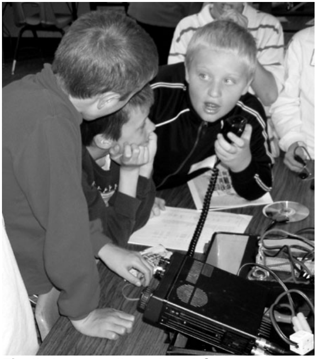
Finally I get to talk on the ORC repeater.

(K9QLP) put on a similar program at St. Joseph's in Grafton. I hope he had as great a time as we did. Perhaps these kids interest in amateur radio will continue into middle school etc.