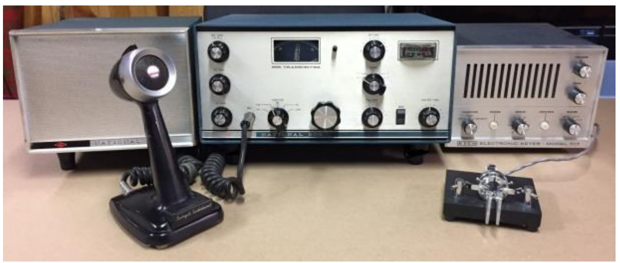
Left to Right are the National NCX-A AC Power Supply/Speaker, the National 200 HF Transceiver, and an Eico 717 Electronic Keyer that shows well with this station. Also shown are the very popular, at the time, Turner 254C "Crystal SSB Microphone." At the lower right is the much later Bencher BY-1 Keying Mechanism.

National decided to take aim at the popular Heathkit SB-100 Transceiver. They pushed the envelope in the marketplace by offering all the features of the kit-built Heathkit SB-100 in a factory assembled radio they called the National 200. It sold for the same price as the Heathkit.