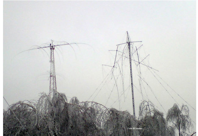
RD3A beam antenna following a freezing rain in Europe. Note that the ice overloaded and broke the trees as well as the beam elements.

The following photo of the RD3A antenna farm is relevant only due to the weather we share and as an example of what we all might experience in the event of a freezing rain.