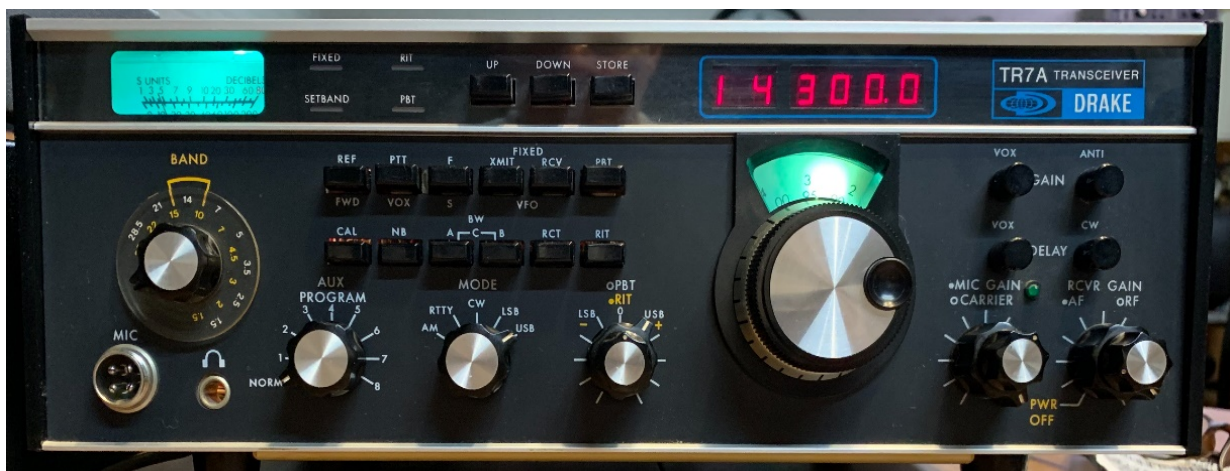
Drake TR7A Transceiver – Equipped with All Options Collection of W9MXQ

Let us not forget where we left off – with Drake’s last major players in the market.