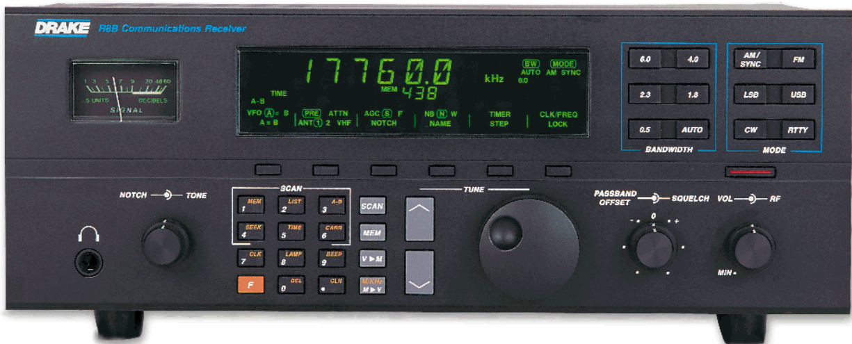
Drake R8B HF Communications Receiver R. L. Drake Advertising Literature

Those world band receivers were led by the R8 series radios 5 . They were excellent performers. Unlike many such radios, these were competitive and could hold their own against the best available transceivers in the amateur radio market at the time. (Reference here is to receiver performance – the R8 was a receiver only.)