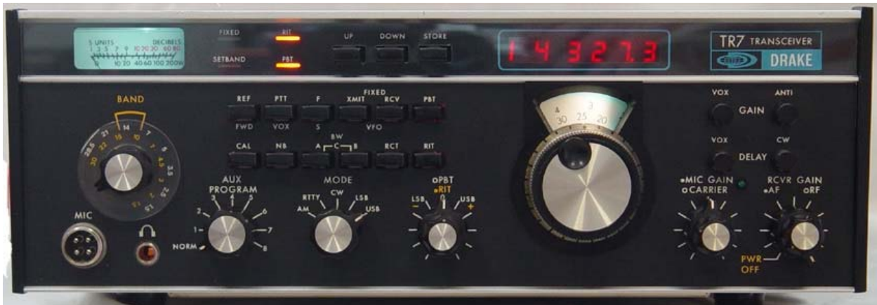
Drake TR7 Transceiver – Equipped with All Options Collection of W9MXQ