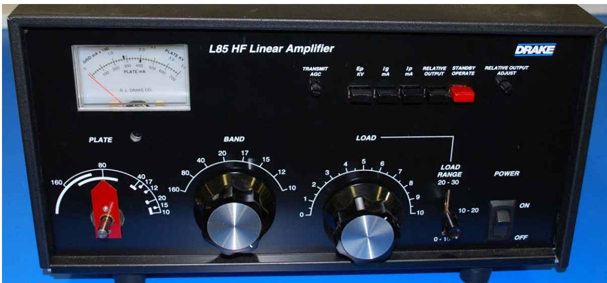
Drake L85 HF Linear Amplifier

One very nearly forgotten, never produced radio from Drake was the L85 Linear Amplifier. Based heavily on the L75 Linear Amplifier, the L85 was styled to match the TR8 Transceiver, in many ways. In other ways it seemed to be a product that could have stood on its own in terms of styling.