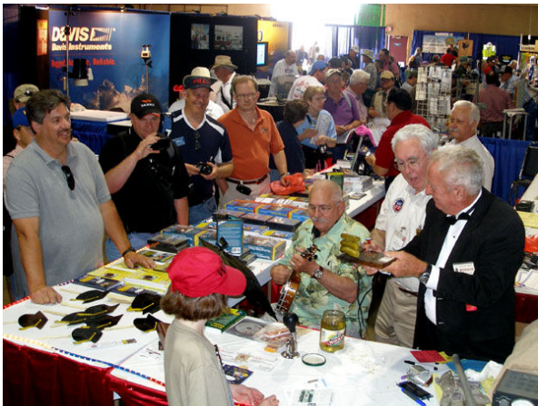
President Bill played banjo as Gordon West demonstrated conductivity by illuminating three pickles in parallel with 120 VAC.