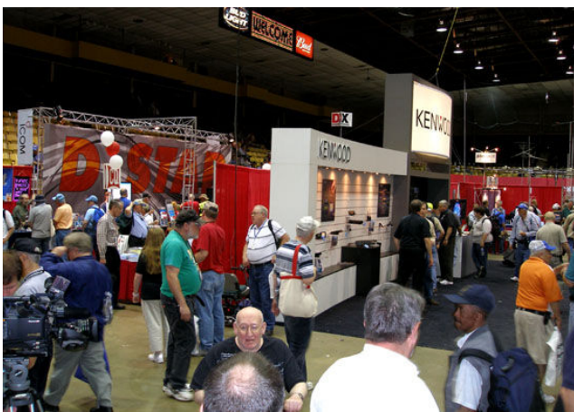
There was a good crowd inside even though it wasn't raining. All the big guns were there with new rigs and accessories.