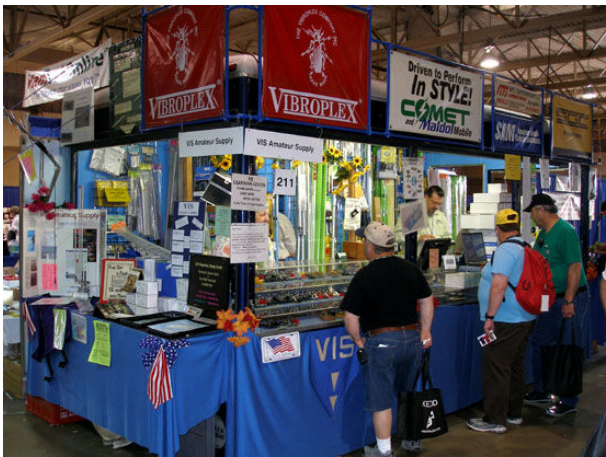
There were a variety of vendors inside with everything from telegraph keys to antenna and it was great fun if only to people watch.