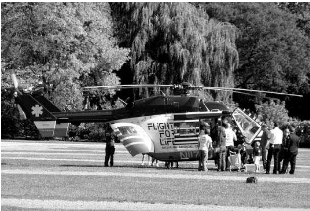
The “Flight for Life” chopper also made a visit so the visitors could see the inside trauma care equipment etc.