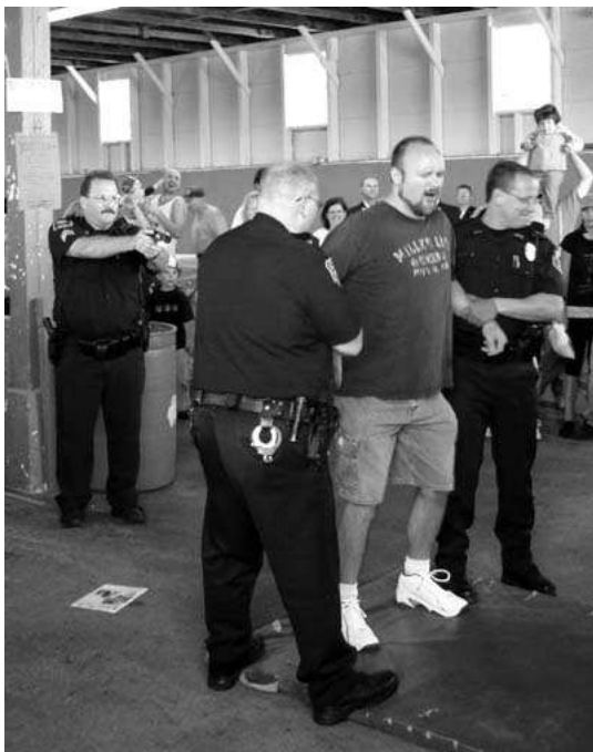
Perhaps the best of all the demonstrations was the TAZER. WOW! Believe me; if someone calls our “tazer-tazer” you want to stop whatever you are doing. Note the mat where the volunteer tazered is allowed to fall forward. Why would anyone volunteer to be tazered?