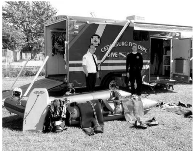
One of the more unique displays was that of the Cedarburg Dive Team. They even had a diver underwater playing tit-tat-toe through the dive tank window.