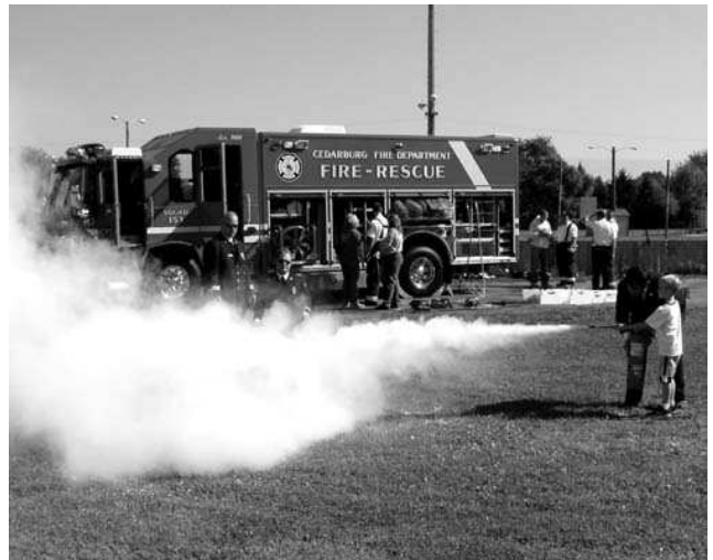
Operating a fire extinguisher can be a memorable experience and the waiting line of operators was long.

As you can surmise, it was an interesting afternoon that provided an opportunity to promote the ORC. In addition, it was fun.