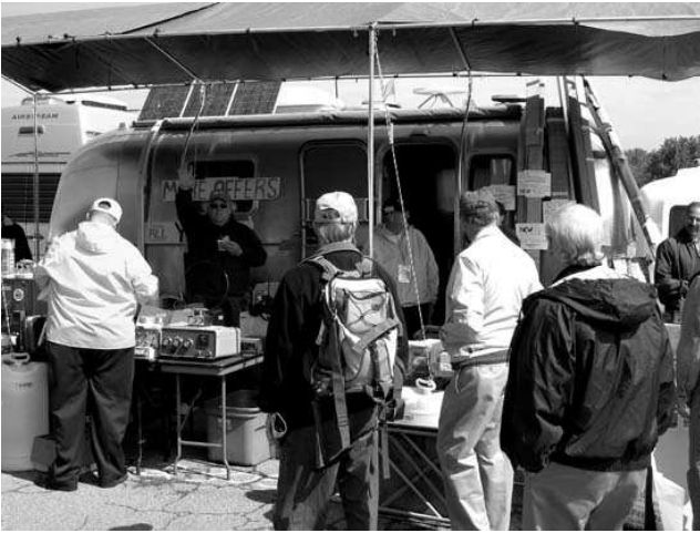
There was a variety of action outside with all manner of vendor accommodations from car trunks to RV's and travel trailers. This one sold a Johnson 6N2 just moments before this photo was taken.