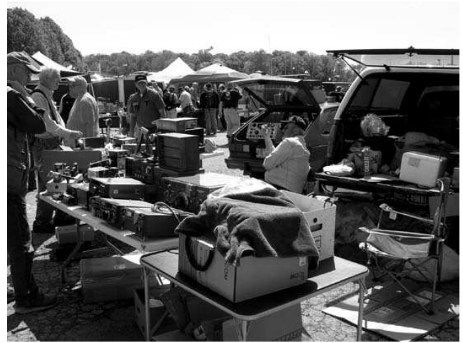
If you were looking for a "rig" or test equipment, it was there – somewhere.