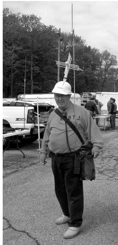
This HF pedestrian mobile is also well equipped for the UHF transmitter hunt with his helmet mounted 2 meter four element rhombic beam.