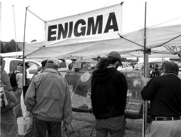
The WWII German Enigma coding machine and display of various code machines and "keys" is always a crowd pleaser at the Hamvention.