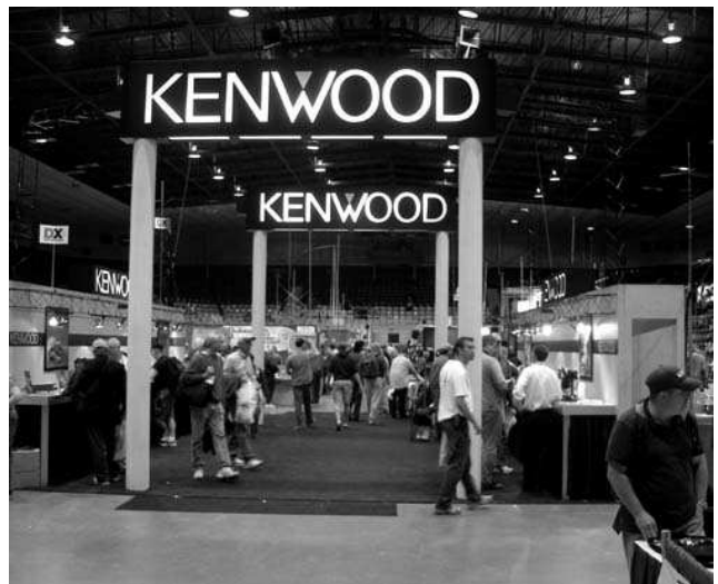
The “big guns” were all inside the arena and convention hall. All the big manufacturers and distributors, including AES, were there and making deals.