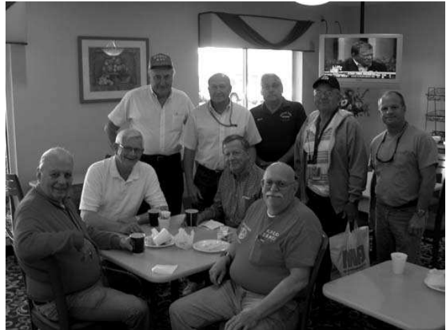
A day of bargain hunting starts with a good breakfast and this was the usual ORC group gathering in the early morning hours.

Well the ORC was again well represented at the Dayton Hamvention with a total of 10 members seeking out bargains.