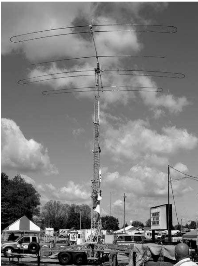
You heard of the Stepper beam antenna. Now you have seen one – big huh?

Then the report (the actual pages to be printed) has to be designed. The printing has to be large enough to read and yet small enough to print all the data. This year I added something new – winter addresses. The problem is that not everyone has one (darn!). It was a bit of a challenge (and a couple of hours "hitting the books") to figure out how to print them for the five members that have them (that I know of). (I just now – AFTER the camera ready copy was delivered to the printer, came up with the idea that I could