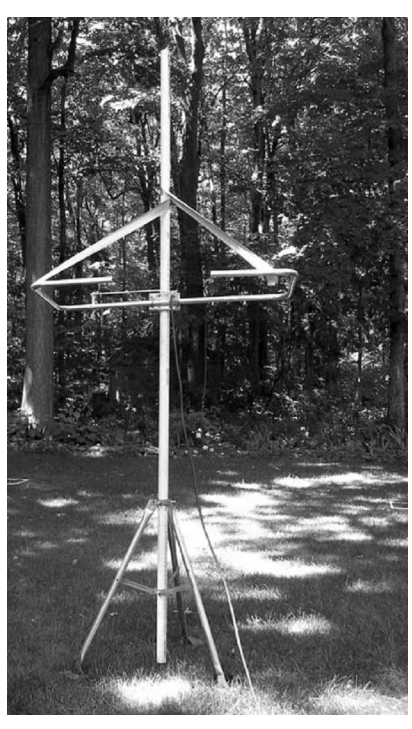
Temporary setup in the back yard for squalo tuning. Duct tape is supporting the squalo in the horizontal position.

Then I moved the setup outside and started to retune the length and gamma match. It made a significant difference and I had to add 6" to each end of the antenna making a total length of 124". It was interesting to note that by adjusting the length and the gamma match I was able to get an SWR of 1.2:1 or better from 50.0 to 51.3 MHz and less than 2.0:1 up to 53 MHz. I was pleased with that and mounted it on the tower.