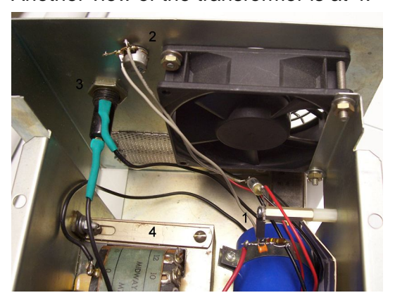
Finally, the back panel is shown next.

The next view is of the back panel, inside the case. The filter capacitor is at 1, just in front of the fan. At 2 is another pot that controls the speed of the fan. I used another variable output 3-terminal regulator to do that, speeding up or slowing down the fan by altering the voltage. Another view of the transformer is at 4.