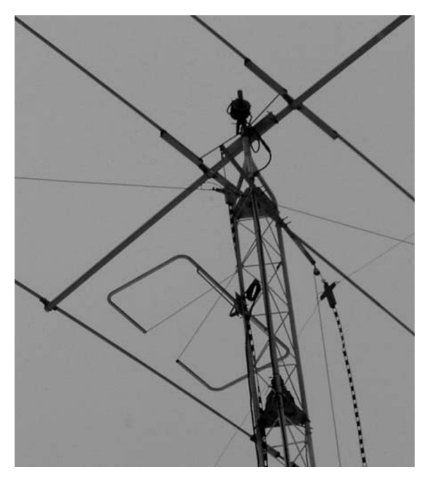
The Lawn Lounge Chair Squalo is shown hard mounted to the tower for horizontal polarization (SSB) with the opening toward the East.

A gamma match is really an interesting feed technique. The capacity between the feed wire inserted inside the gamma tube and the tube cancels the inductive reactance of the antenna and the shorting bar between the tube and antenna is adjusted to find the 50-ohm impedance point. Closer to the center is lower impedance while moving the shorting bar further out is to a higher impedance area.