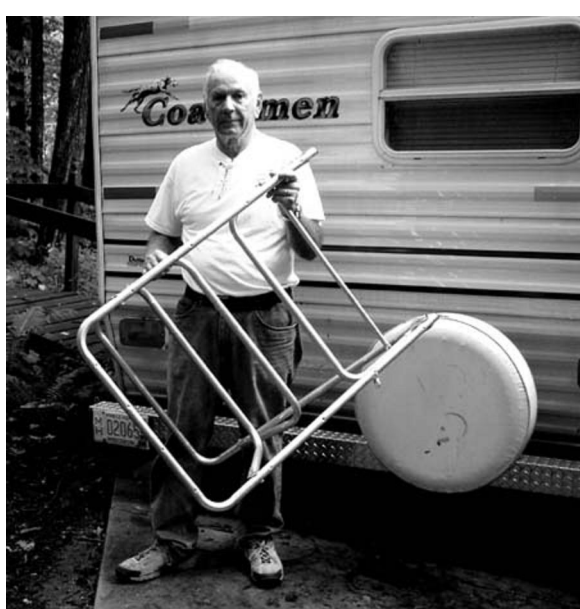
Would you believe that someone discarded this perfectly good potential antenna?

Actually it all started in an RV park in Orlando where we were staying last February. I was walking the dog and there it was – right before my eyes in a pile of scrap aluminum – a discarded lawn lounge chair made of 1" tubular aluminum.