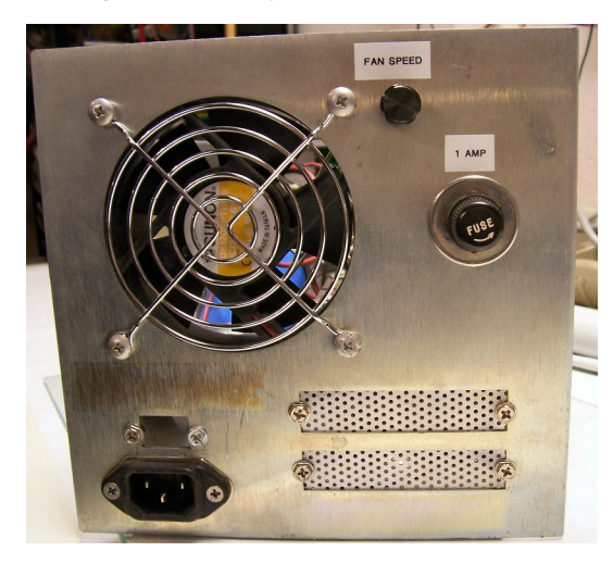
The fan, fan speed knob, fuse and the filtered AC input connector are all seen here.

Simple, but it works! That 10-turn pot on the front panel really makes fine voltage adjustments a snap. I am glad I opted for it, rather than a standard 1-turn model.