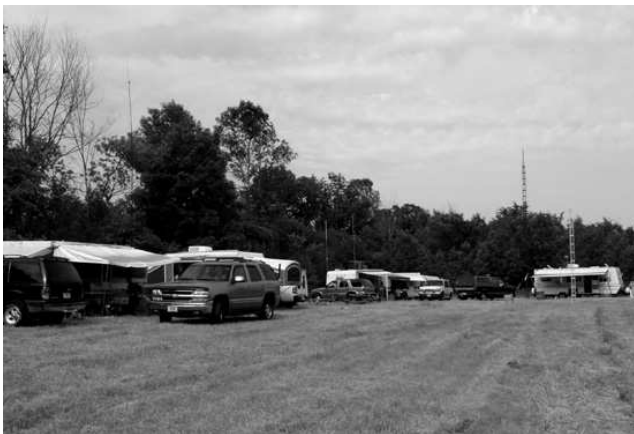
There were plenty of places to stay during field day including these travel trailers, pop up campers and dome tents. There was plenty of overnight space available for those who wished to stay and operate the “3 rd shift”.