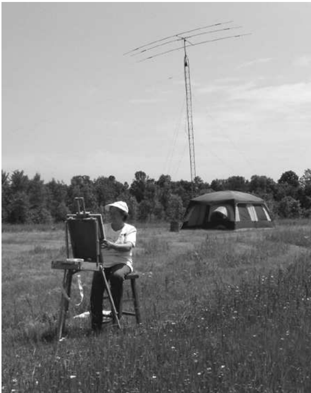
Field Day is not all “radioing”. Here Julia (KB9WBQ) took a break to do some sketching of the field day scene.