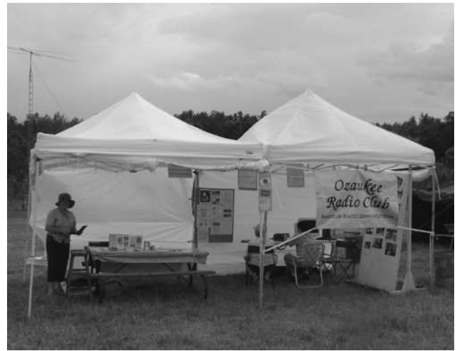
Julia Nawrot (KB9WBQ) set up the public relations tent in conjunction with the GOTA activities. If the sky looks a little dark you would have found it cleared up just after the rain.