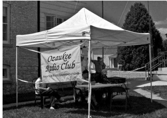
The weather was great and the shade of the tent welcome at the Port Washington Lighthouse Activation ORC special event station.

After the big Corn Roast on Saturday morning, the action moved to the 1860 Lighthouse in Port Washington where on August 16 and 17, the ORC operated a special event station in the International Amateur Radio Lighthouse Weekend.