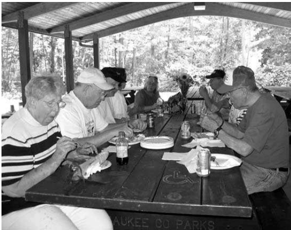
Ah! Food is good. What more need be said.