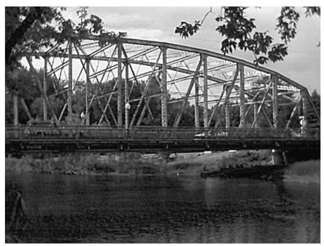
This landmark Saukville Bridge will be replaced with a "modern" bridge in 2005.

It may be the last year it gets cleaned under this bridge. A new one will replace it before the next Riverfest. A great lunch was served after the cleanup. Next years' date has not been set at this time.