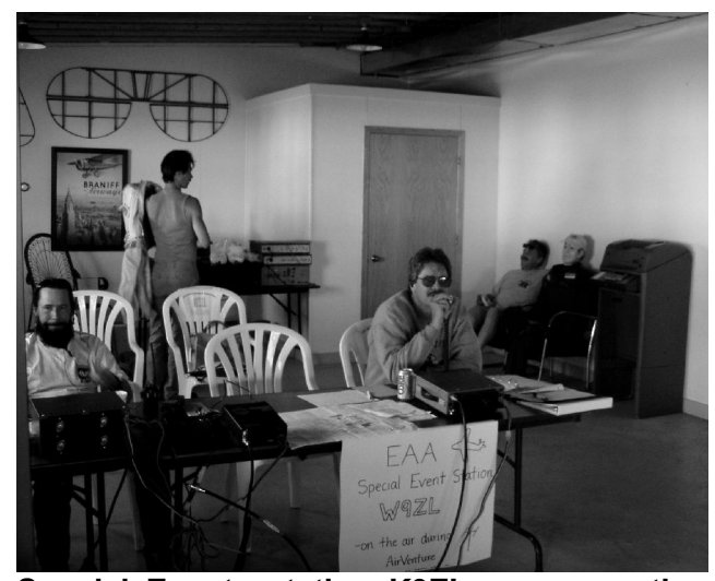
Special Events station K9ZL was operating from a main exhibit hanger at Pioneer airport during the EAA Airventure in Oshkosh.

The Fox Cities Amateur Radio Club operated a special event station on 3 different bands at the Pioneer airport during the 2004 Airventure in Oshkosh this year. While I was impressed with the activity I was somewhat disappointed that they were operating current technology equipment.