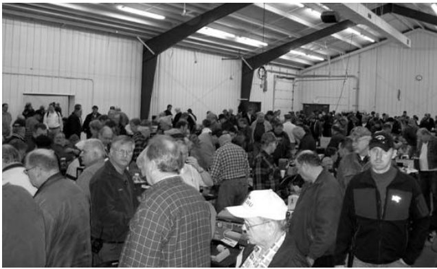
The West Allis Amateur Radio Club had an excellent crowd at their January – swapfest. This is the main of three halls. There was no sign of declining swapfest activity here.