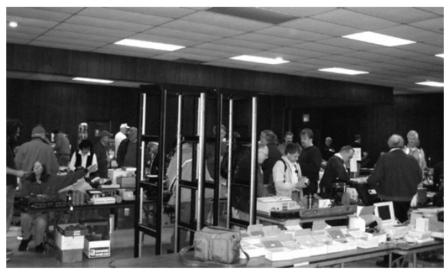
Bargain hunters milled about the 70+ vendor tables set up at the Circle B banquet hall for the ORC Swapfest.

no exception in that the Swapfest had a gross revenue of $2260 and after expenses resulted in a net income to the Club of $1,811.39.