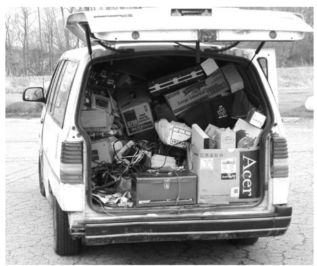
Another Ham unloads his excess wares for sale at the ORC Swapfest.

The ORC Swapfest actually starts in Ham's basements and garages and it provides annual the operating funds for the Club. This year was