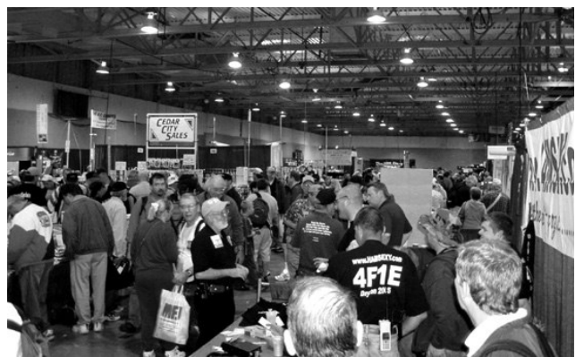
Even on a nice day the inside vendors are swamped with lookers, questioners and buyers.