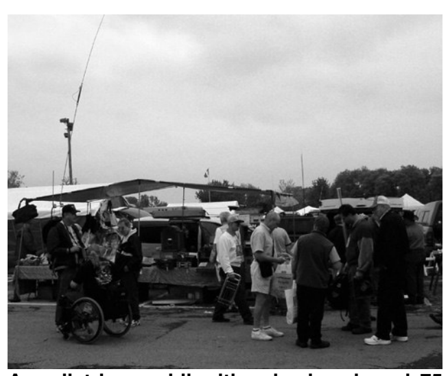
A pedistrian mobil with a backpack and 75 meter whip was patrolling the grounds and getting quite a few looks of amazement.