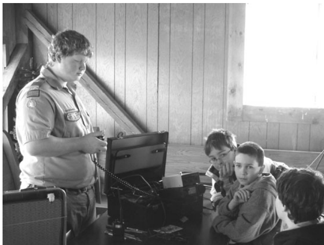
Boy Scouts using the portable HF station at the Jackson Town Hall at the Radio Merit Badge day. The antenna was a portable 18AVT vertical and a solar panel was used to maintain the battery.

Is it really portable? Well it has a handle on it but I carry it using both hands.