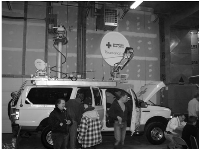
One of the 9 Red Cross Communications Vans – Wow – 14 different communications mediums – impressive.

tory and the antenna he won in the AES transmitter hunt.