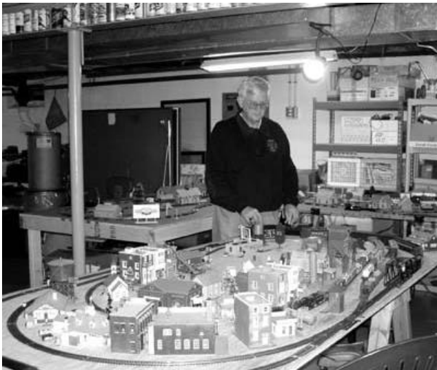
Radios, fire trucks and trains – What's next?