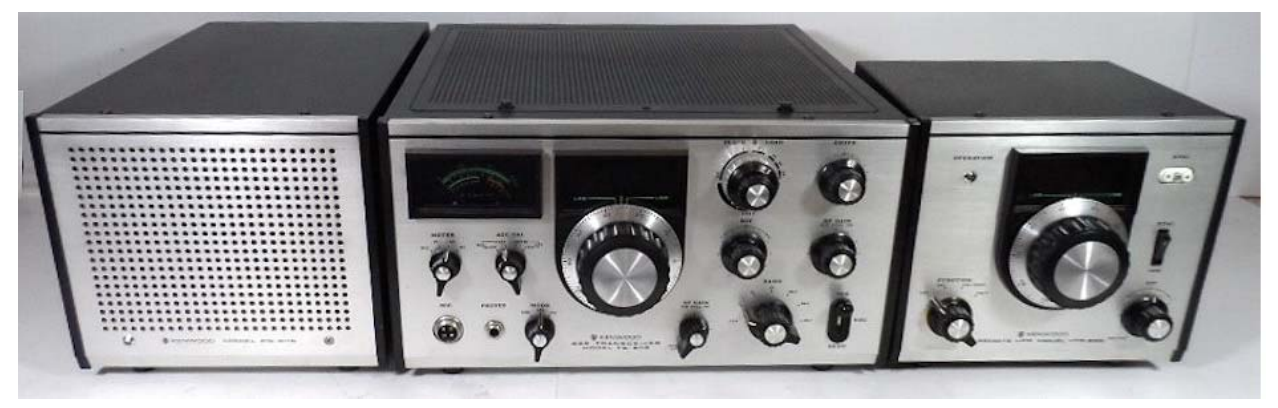
Kenwood TS-511S HF Transceiver with Power Supply and Remote VFO (from the October 2020 Newsletter)

So, for reference, here is the TS-511S that is in this discussion: