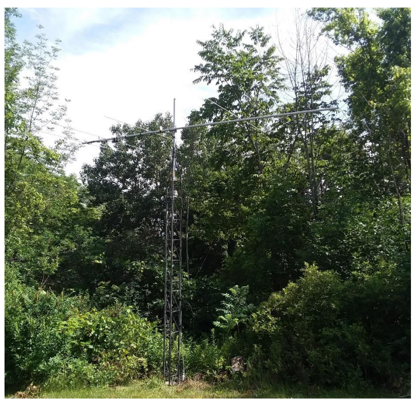
New low 6-meter beam at W9XT

weak signal operators on the VHF+ bands, plus learning a lot from the talks and a published proceedings book.