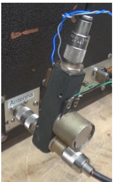
Dow Key Antenna Switching Relay See description, below, for notes about how this is connected.

Here are the accessories that I used with the Valiant and HQ-170AC back in the 1960's. These very accessories are still with me today – just as I bought them "back in the day." For some reason they just never left! They are in use right now in the setup of the Valiant and the HQ-170AC-VHF.