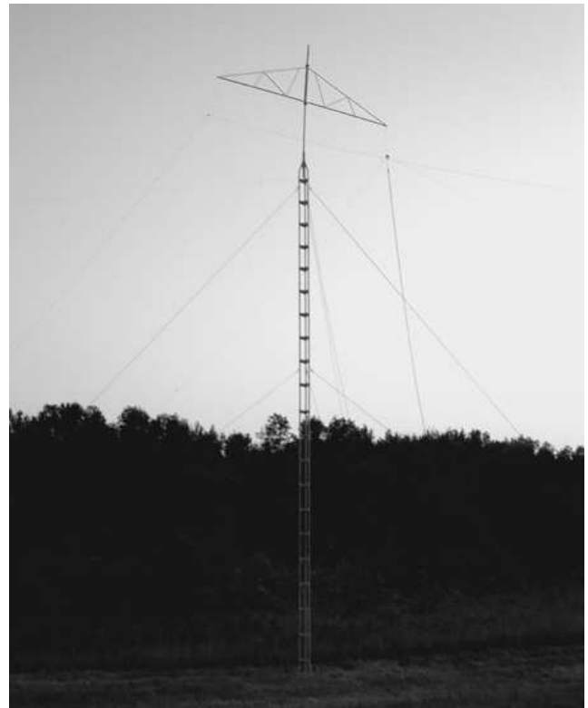
The newest antenna in the area was a 2 element YAGI on 40 CW designed and fabricated by Gary Sutcliffe (W9XT) and Mark Potash (KC9GST). It was an inverted V reflector and inverted V driven element pointed West to California.

What happened to the safety rules we thought were in place? Namely, the spacing of vehicles & campers relative to towers? There were several violations in the area of 40 PH. We should do better next year. There was a considerable area to the east of the operating trailer that was mowed, but unused. Perhaps we should rethink the positioning of the towers and/or vehicles in that area.