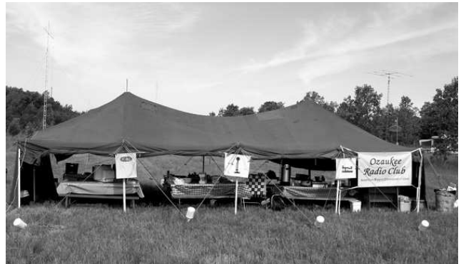
The Korean War era mess tent is set up along with a display of the "high QSO count" flags.

It all starts Thursday evening when "the crew" empties the shed and delivers the stuff to Lazy Days Campground. The first order of business is to set up the cook tent. It is not equipment related but forms a most important part of the social aspects of Field Day.