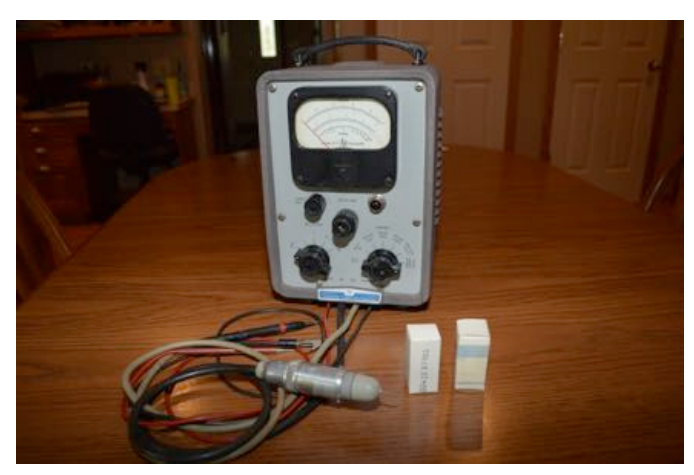
700 MHz! Ya, this was back in about 1958!

I have been fixing many pieces of Collins gear, both the Gold Dust Twins and many S-Line radio's. I love using my modern Fluke DVM's with the Type 85 RF probe, but it can only handle a maximum RF voltage of 30 Volts AC. Most vacuum tube transmitters require a grid voltage of 60-80 volts for either the 6146 series or the many sweep tubes employed in transmitters from that era. So, I turn to the Hewlett-Packard Model 410B RF Voltmeter for these repair efforts.